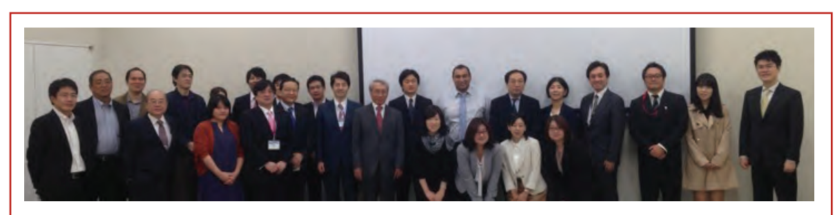
International Investigators Meeting held in Osaka, Japan on October 6, 2013