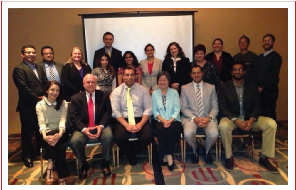
Regional Investigators Meeting held in Philadelphia on October 10, 2013